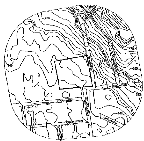
500' TOPOGRAPHY MAP NOT TO SCALE