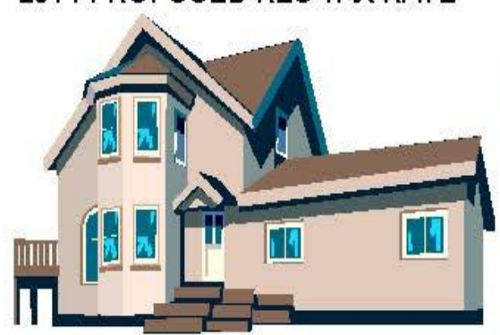
2015 REAL ESTATE VALUE (BASED UPON 2013 REVAL) 2014 PROPOSED RES TAX RATE