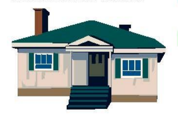
2014 REAL ESATE VALUE (BASED UPON 2010 REVAL) 2013 RESIDENTIAL TAX RATE